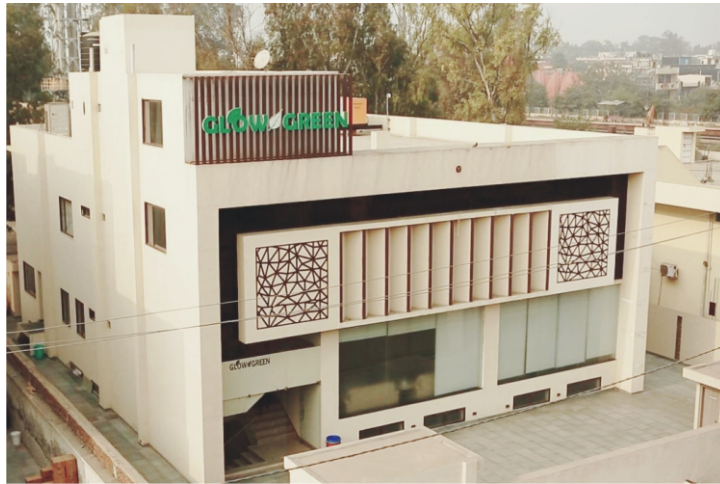
Corporate Office / R&D Centre / Production Unit

Don't be mean; be GREEN because Green actions speaks louder than the grey words.